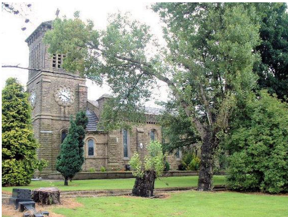
St. John's Church, Pendlebury

St. John the Evangelist Churchyard, Pendlebury contains 29 Commonwealth War Graves – 15 from World War 1 & 14 from World War 2.