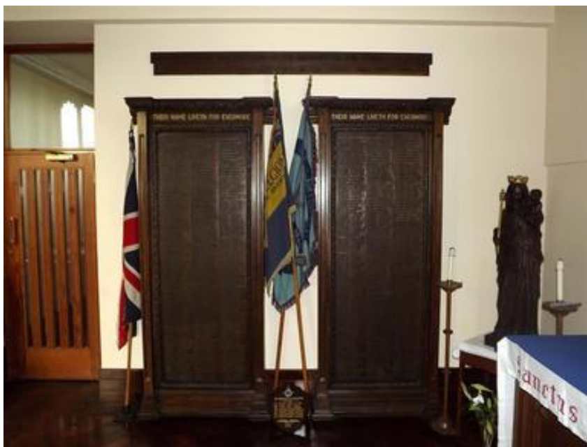
St. Thomas' Church, Pendleton Roll of Honour